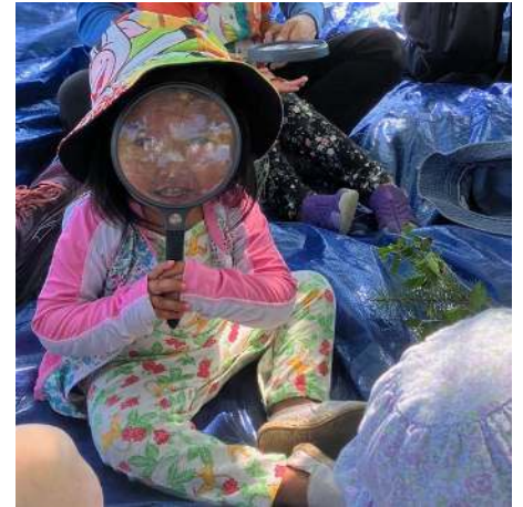
KIN at La Familia / The Family Center Child Care Center

interactive wind pollination activity for "Pollinators in the Mountains"), and two mornings at La Familia / The Family Center Child Care Center in Fort Collins (teaching about "Trees" in June and "Water and Rivers" in July to three classes each day) – all in addition to three KIN hikes on a Canyon Lakes Ranger District trail. We have the potential for four more educational outreach events and four more KIN hikes yet this year.