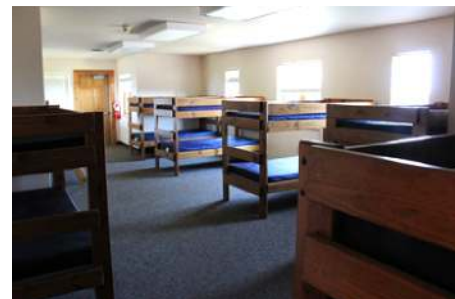
Bunk Beds at Buckhorn Ranch

Mark May 17-19 on your calendar. Hope to see you there!