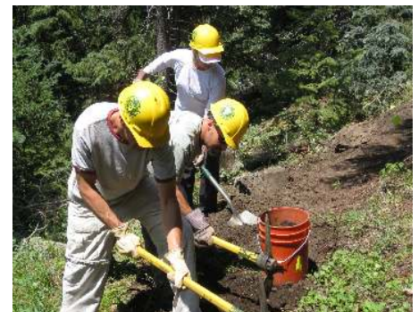
PWV Working on the Trail