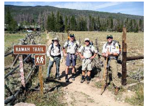
PWV Members on Patrol

“This 24-year-old all-volunteer organization now has about 320 members, aged 18-over 80, who ride and hike with a purpose, serving the US Forest Service and everyone who values our wilderness.”