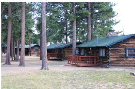
Buckhorn Ranch in Rist Canyon

Who is Spring Training for? Well, certainly it's for the traditional attendees who are new recruits, Animal Group