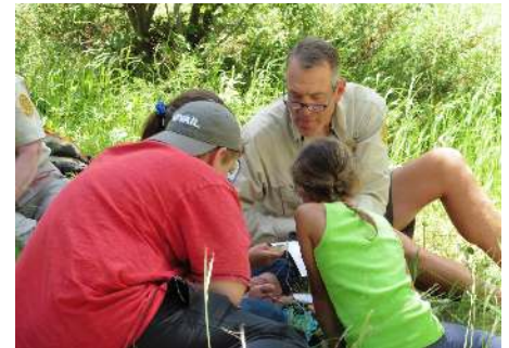
KIN Hike-Compass Lesson

file of the receipt, contact Sandy Sticken for details. Please include information as to the event or committee for which the purchase has been made. For appropriate accounting documentation, a receipt needs to show the store name, date of purchase and amount of purchase.