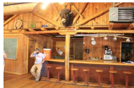
Buckhorn Ranch Dining Hall

"PWV's are glad to see the 'Federal Shutdown' over. Folks may have noticed members on their own cleaning toilets at Poudre and Red Feather Trailheads. Thanks to all the 'citizen volunteers!'"